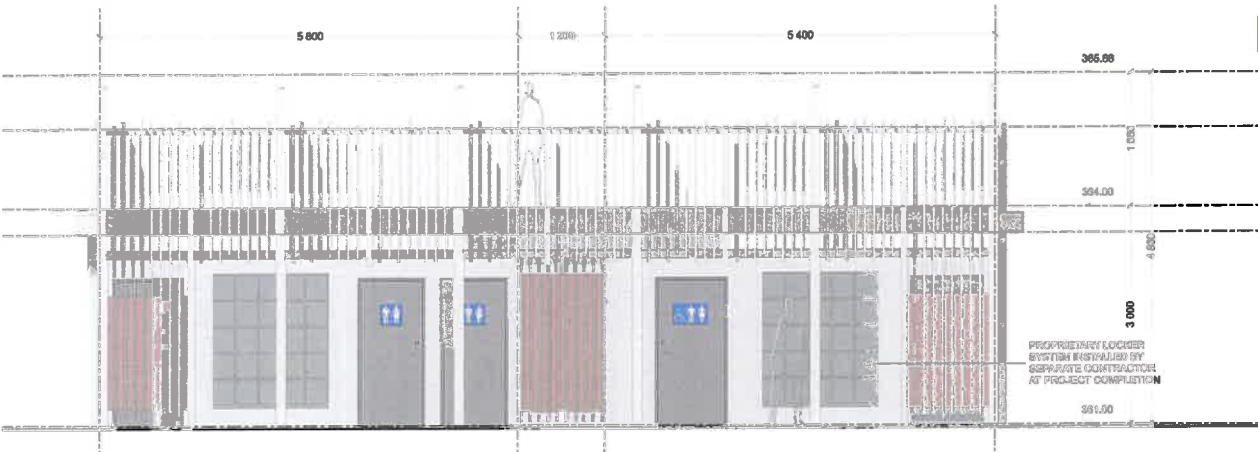
NORTH ELEVATION SCALE 1:50

PERMACRETE LOCKER SYSTEM INSTALLED BY SEPARATE CONTRACTOR AT PROJECT COMPLETION