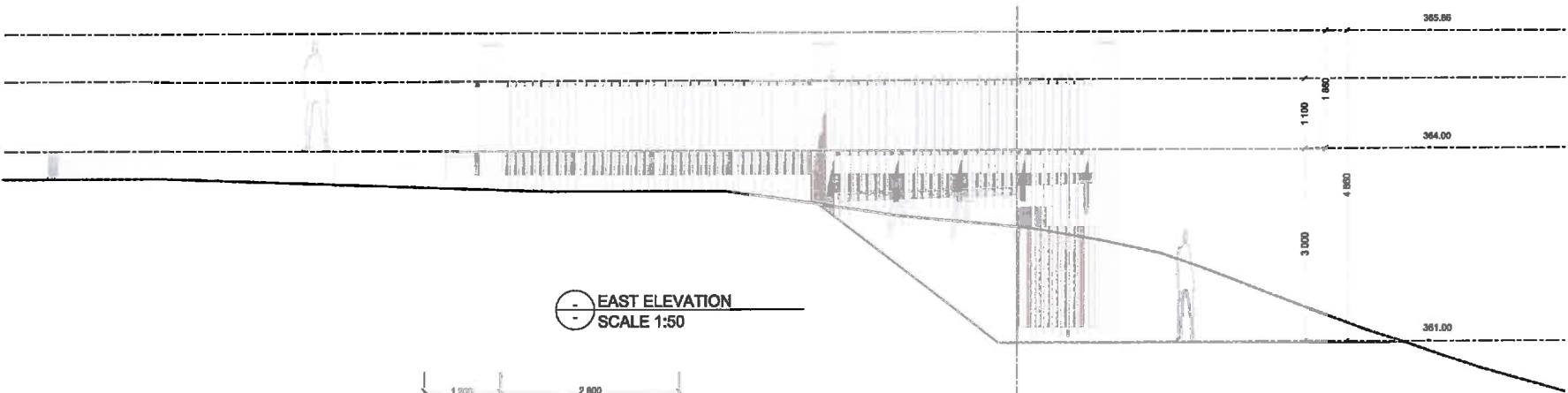
EAST ELEVATION SCALE 1:50

PERMACRETE LOCKER SYSTEM INSTALLED BY SEPARATE CONTRACTOR AT PROJECT COMPLETION