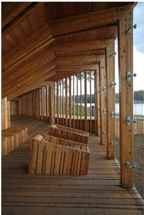
Design concept direction. Benchmark imagery.