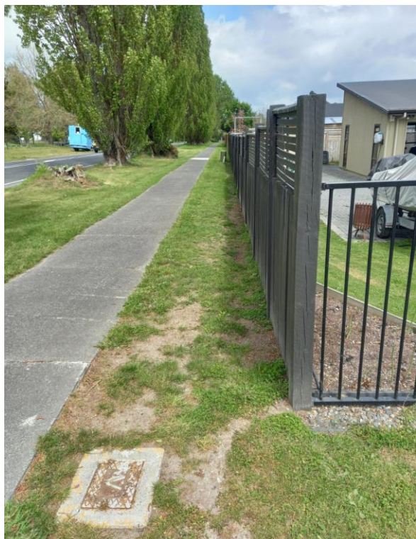
Photograph illustrating distance between tree base and property boundary with alignment of water main running beside the path.

Council road reserve. Council's contract arborist has advised that undertaking the root pruning further from the base of the trees at the lower level would likely be more successful in containing the roots.