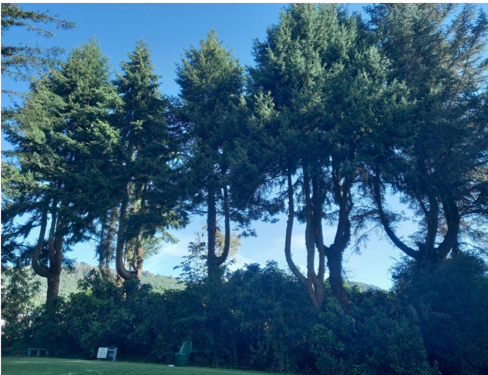
Shelter belt taken from golf course

An arborist's assessment [Attachment 1] of the health of the trees concluded that they range from 'Average to Poor' condition. He noted that the historical topping or hedging of the trees had compromised them somewhat.