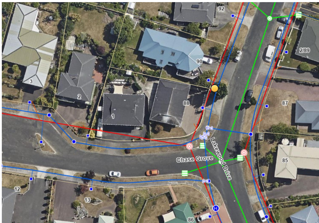
Position of Elm tree marked with yellow dot.

The property owner at 100 Lakewood Drive, Taupō has contacted Council asking that the Elm tree on the berm adjoining 88 Lakewood Drive, He has stated that 50% of his view to the lake has been impeded by the growth of this tree since he purchased his property.