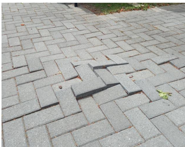
Photographs showing cracking of concrete and lifting of cobbles.

Council's contract arborist has assessed the trees and believes they are in 'Good to Average' condition. The trees are not on Council's Amenity Tree register but do form part of the line of Poplar trees on Kinloch's entrance. Collectively they are very significant on the landscape. The arborist has suggested that the best method of addressing the root issues is to prune the roots and install root guard on the lower level, within the