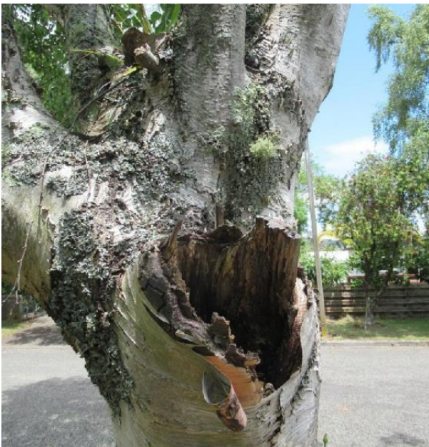
Photograph of decay from pruning wound on one of the trees

Council's contract arborist's assessment [Attachment 1] of the health of the trees concluded that they are in 'Average to Poor' condition. He noted that both trees have been previously topped and this has resulted in the trees becoming structurally poor. Both have slender, competing stems arising from the previous pruning points. They also have large pruning wounds in structurally vulnerable locations. Silver Birch are prone to decay following topping or removal of large limbs.