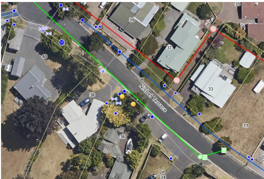
Location of trees marked by yellow dots

Council's contract arborist has assessed the trees and believes they are both in 'Very Good' condition. He observed that as the trees are directly to the north of 36 Nisbet Terrace they will be casting significant shade over the home. He also added that there are several other large trees within the property of 36 Nisbet Terrace that will be adding to the shading issues. He noted that the Silver Birch was likely planted as part of the original street scaping as it is in fitting with others in the street. He felt that the Totara may have been planted by a previous owner or could have been self-sown as it would be unlikely that Council would plant a tree like this so close to an existing one. He feels that there is no pruning that could be undertaken to improve the situation but if Council were to do anything to reduce the shading issue, removal of the evergreen Totara would be the better option as the Silver Birch is more appropriate in size and form for the location. He did advise however that regular minor crown reduction of the Totara could be undertaken to maintain it at its current height.