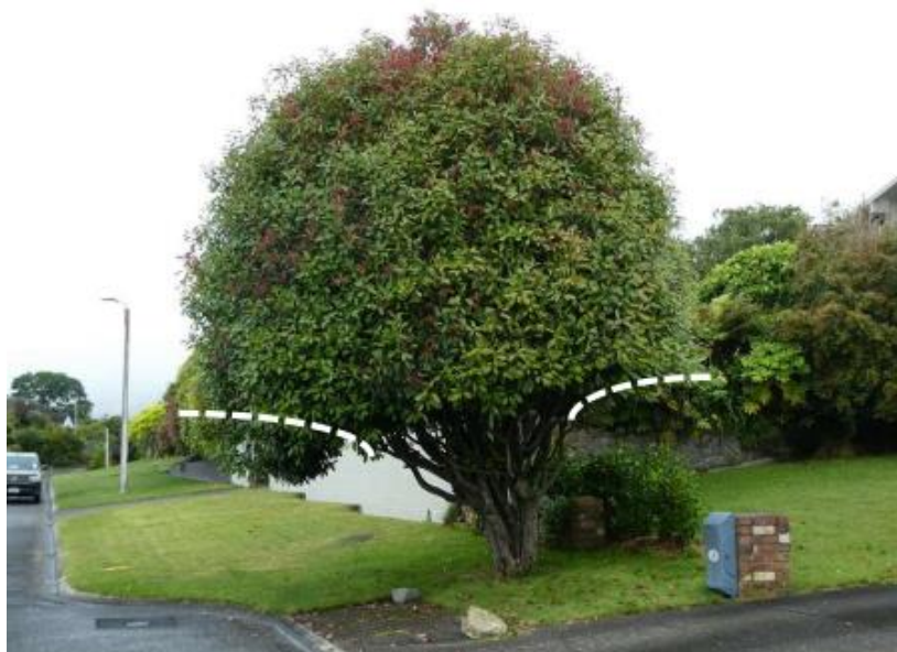
Photograph from arborist showing recommended extent of lifting.

Council's Contract Arborist has assessed the tree and believes it is a healthy specimen, well located within a wide berm. He believes the Red Robin makes a positive contribution to the streetscape and has suggested minor crown lifting of the tree to improve site lines beneath the canopy will address any visibility issues. Council's Transportation Team have viewed the tree and agree that minor crown lifting will alleviate any visibility issues, particularly if a driver was to stop at the end of the driveway before pulling out onto the road.