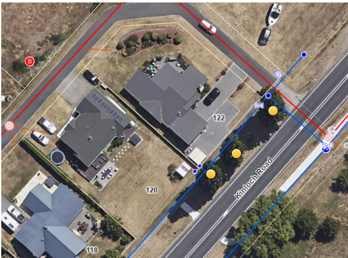
Aerial showing position of trees marked by yellow dots

The section was developed in 2008. The driveway and front section of the property is approximately 400mm below the level of the road and the trees. The cutting to level the section would likely have extended to at least 600mm. At this depth, the majority of roots on the house side of the tree would have been cut through. Thus, Council's contract arborist believes that it is most likely that the roots causing the damage are regrowth from this initial cutting.