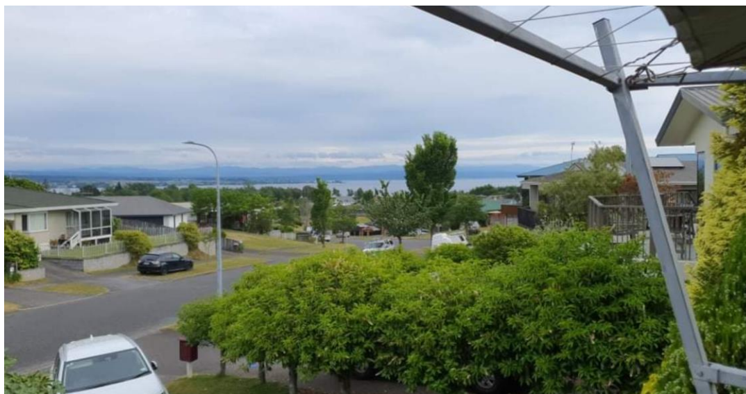
Photograph taken from 100 Lakewood Drive.

Council's Contract Arborist's assessment of the health of the tree concluded that it is healthy and in 'Very Good' condition. He believes the tree is significant within this landscape as it is the largest in the area. He does not believe there is any arboricultural reason to justify the removal of the tree and there is no acceptable pruning option to reduce the tree from the view shaft.