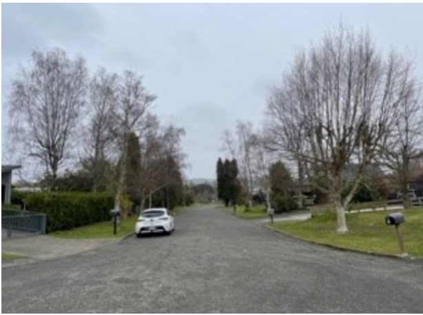
Photograph of street planting of Silver Birch

Council's contract arborist's assessment [Attachment 1] of the health of the trees concluded that they are in 'Average to Poor' condition. He noted that both trees have been previously topped and this has resulted in the trees becoming structurally poor. Both have slender, competing stems arising from the previous pruning points. They also have large pruning wounds in structurally vulnerable locations. Silver Birch are prone to decay following topping or removal of large limbs.