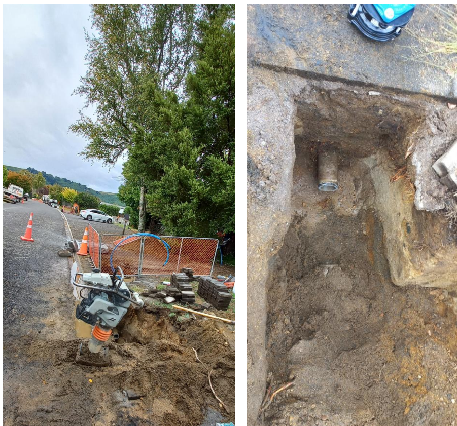
Photographs showing proximity of water line work to trees and minor roots encountered within trench.

Council has recently undertaken an upgrade to the water supply in Nisbet Terrace. The neighbour at number 33 Nisbet Terrace has raised concerns that this work may have adversely impacted on the health of the Totara tree by digging through its roots. Council's contract arborist revisited the tree to assess any damage. Although the site had been reinstated and he could not see any roots that may have been exposed he felt that as the work was 2.7 metres from the base of the tree, which would be outside the tree's structural root zone, any root damage would be within the tree's range of tolerance. Thus, it is unlikely that any work would have impacted on the tree's structural stability. This has been supported by Council's Infrastructure Project Manager who was on site when the contractors worked in the vicinity of the trees. The line in this area was thrust at a depth of approximately 1.5 metres. The only excavation in the area was done in the driveway of 38 Nisbet Terrace to repair a damaged line, more than 3 metres from the base of the tree. He has confirmed that no roots were exposed in this excavation.