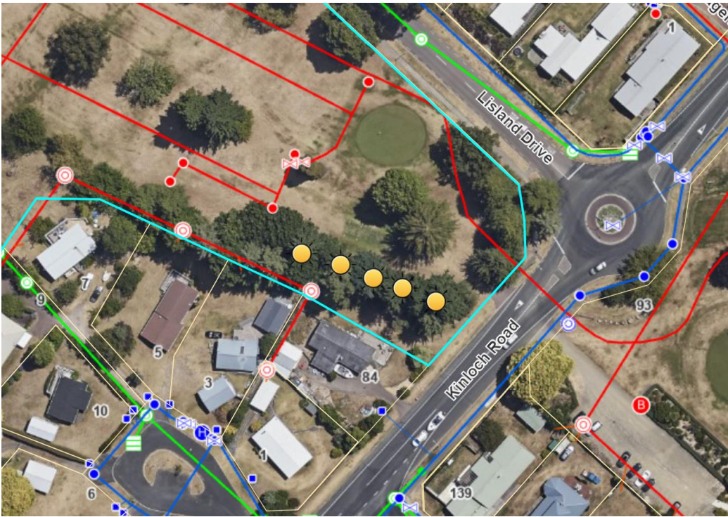
Location of shelter belt showing the trees with yellow dots.

Some of the trees sit over a waste water main but there have been no records of roots damaging this.