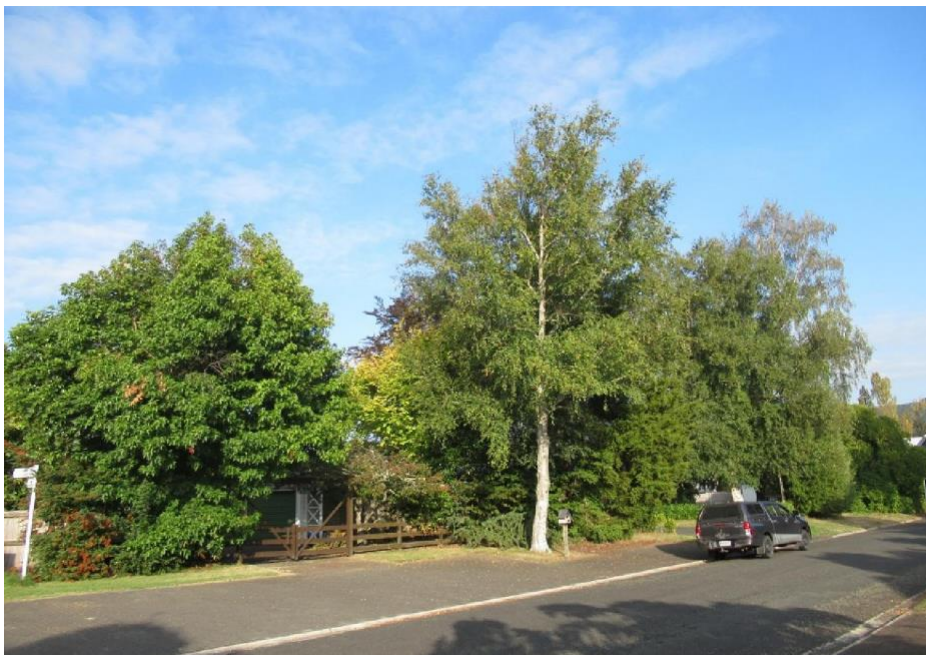
Photograph taken from 33 Nisbet Terrace looking across to 36 Nisbet Terrace

Council's contract arborist has assessed the trees and believes they are both in 'Very Good' condition. He observed that as the trees are directly to the north of 36 Nisbet Terrace they will be casting significant shade over the home. He also added that there are several other large trees within the property of 36 Nisbet Terrace that will be adding to the shading issues. He noted that the Silver Birch was likely planted as part of the original street scaping as it is in fitting with others in the street. He felt that the Totara may have been planted by a previous owner or could have been self-sown as it would be unlikely that Council would plant a tree like this so close to an existing one. He feels that there is no pruning that could be undertaken to improve the situation but if Council were to do anything to reduce the shading issue, removal of the evergreen Totara would be the better option as the Silver Birch is more appropriate in size and form for the location. He did advise however that regular minor crown reduction of the Totara could be undertaken to maintain it at its current height.