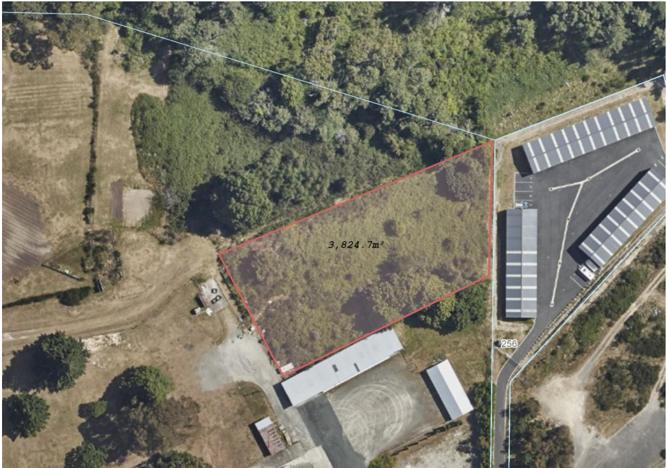
Figure 1 - indicative lease area