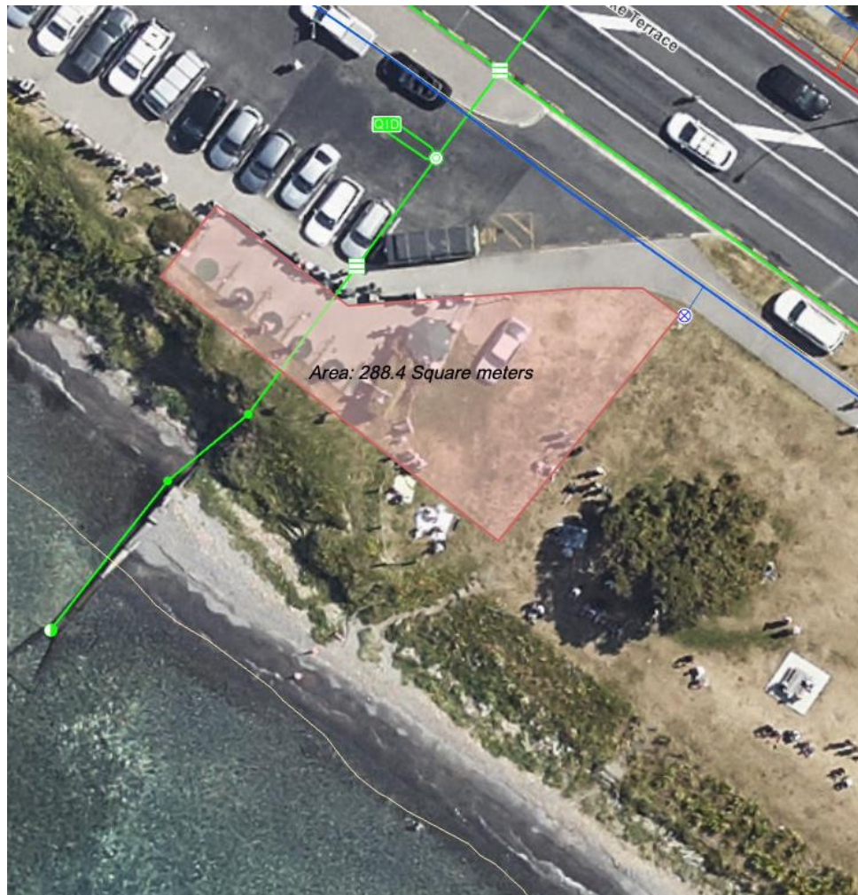
Figure 1 - indicative lease area