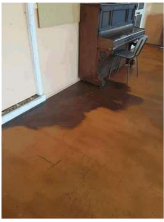
*Alterations *Bathroom Renovations *Kitchen Installations *Repairs & Maintenance