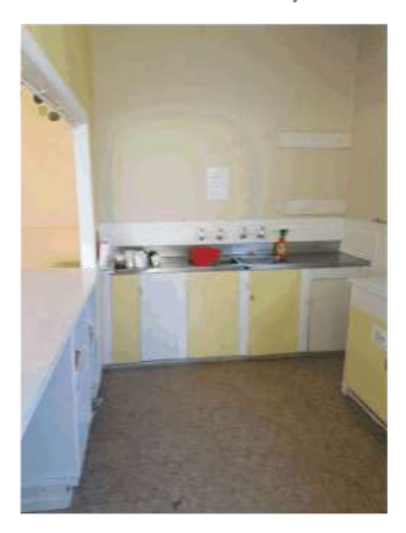
*Alterations *Bathroom Renovations *Kitchen Installations *Repairs & Maintenance