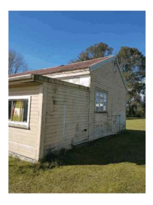
*Alterations *Bathroom Renovations *Kitchen Installations *Repairs & Maintenance