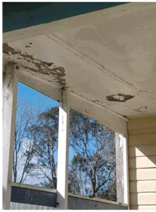
*Alterations *Bathroom Renovations *Kitchen Installations *Repairs & Maintenance