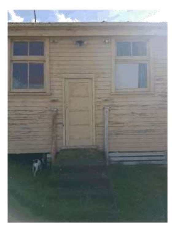
Kitchen: The kitchen is dated but tidy.