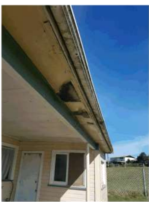
*Alterations *Bathroom Renovations *Kitchen Installations *Repairs & Maintenance