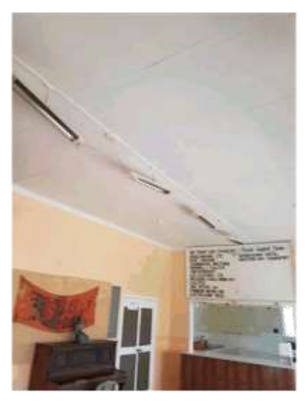
*Alterations *Bathroom Renovations *Kitchen Installations *Repairs & Maintenance

Heating: There is an old fireplace in one corner of the room, which I would suggest should not be lit without a qualified contractor inspecting its installation/safety. There does not appear to be the correct hearth used for the type of fireplace that is present. There appears to be ceiling mounted bar heaters at the other end of the clubrooms. Again I would suggest that these bar heaters be checked before use.