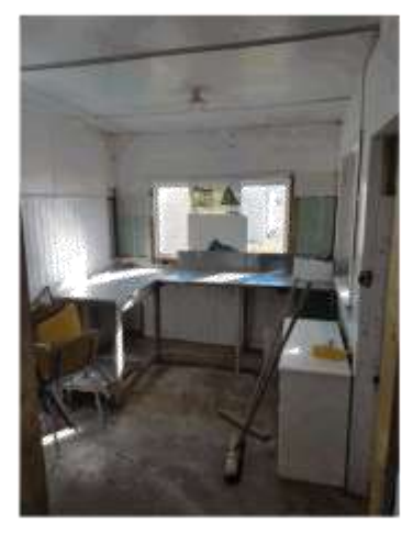
*Alterations *Bathroom Renovations *Kitchen Installations *Repairs & Maintenance

Foindations/Floor: The underside of the building is showing some signs of borer, and decay. It appears that there has been some settling in the corner of the building where the toilets are located. The building appears to be lower it that corner and this shows up by the door that leads into the toilet area binding on the floor when opened, however has a considerable gap benieth it when shut. The floor has a sizable water stain damage outside the Bar area which could have reduced the integrity of the floor itself. The floor coverings to the Kitchen area could possibly be an asbestos backed vinyl due to its age. There is an area next to the kitchen which has been partially deconstructed and in a state of dis-repair. Two of the windows in this area have broken panes of glass, and are temporary covered over.