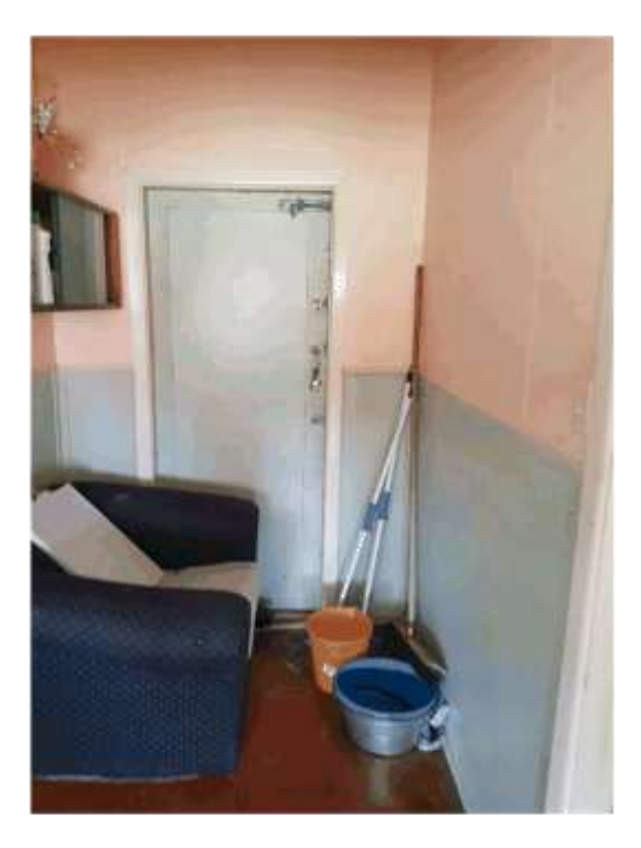
The Emergency exits lead out the back of the building down steps which do not have any handrails installed.