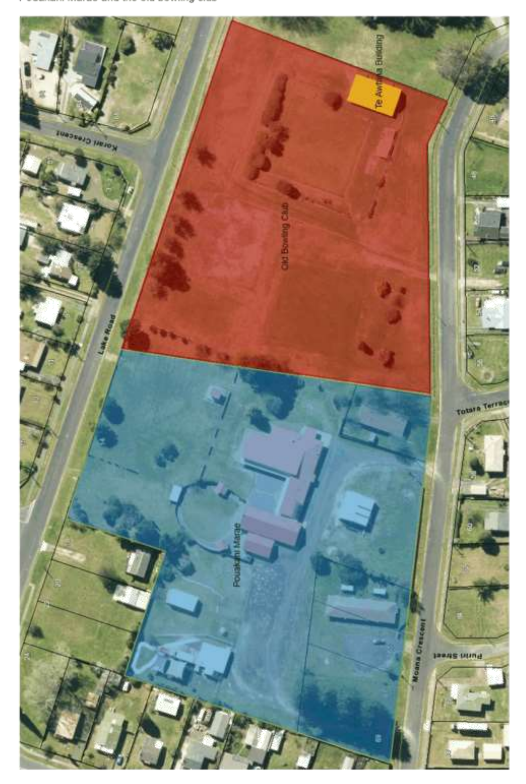
Pouakani Marae and the old bowling club