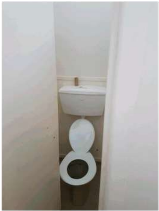
*Alterations *Bathroom Renovations *Kitchen Installations *Repairs & Maintenance