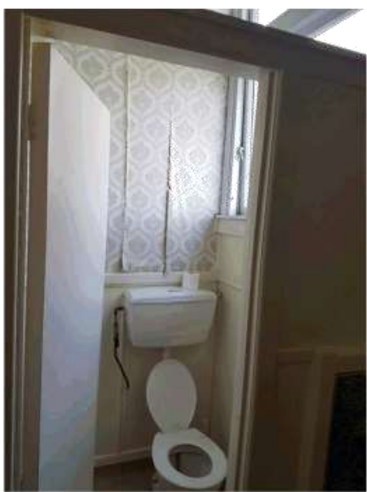
*Alterations *Bathroom Renovations *Kitchen Installations *Repairs & Maintenance