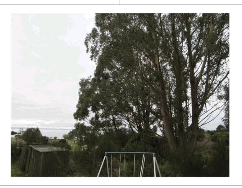
Trees viewed from nearest caravan site, looking north.