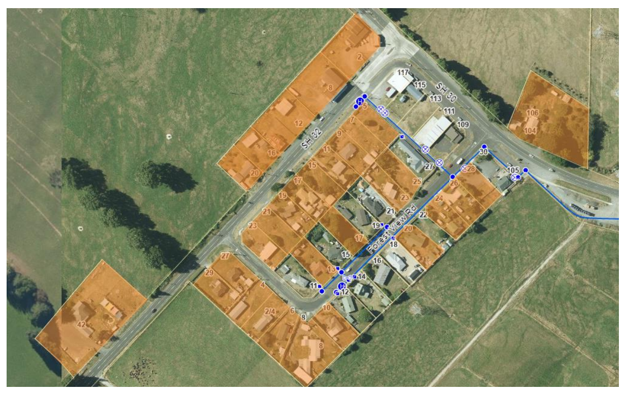
Image 1: Orange Highlighted properties are not currently connected to water. Blue lines identify the existing water mains

A Council reticulated water network is located throughout part of Whakamaru and provides treated drinking water to 15 properties. The network does however not extend to 31 properties along Tihoi Road, Forest View Road and one property on State Highway 30. The properties who are not currently connected to the Council water scheme provide their own water supply. The orange highlighted properties in Image 1 below, identify those properties not currently connected to the water supply.