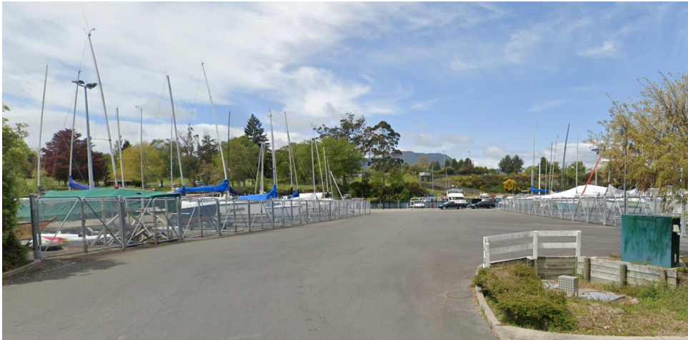
Figure 2 - Street view image of boat pens from Rauhoto Street