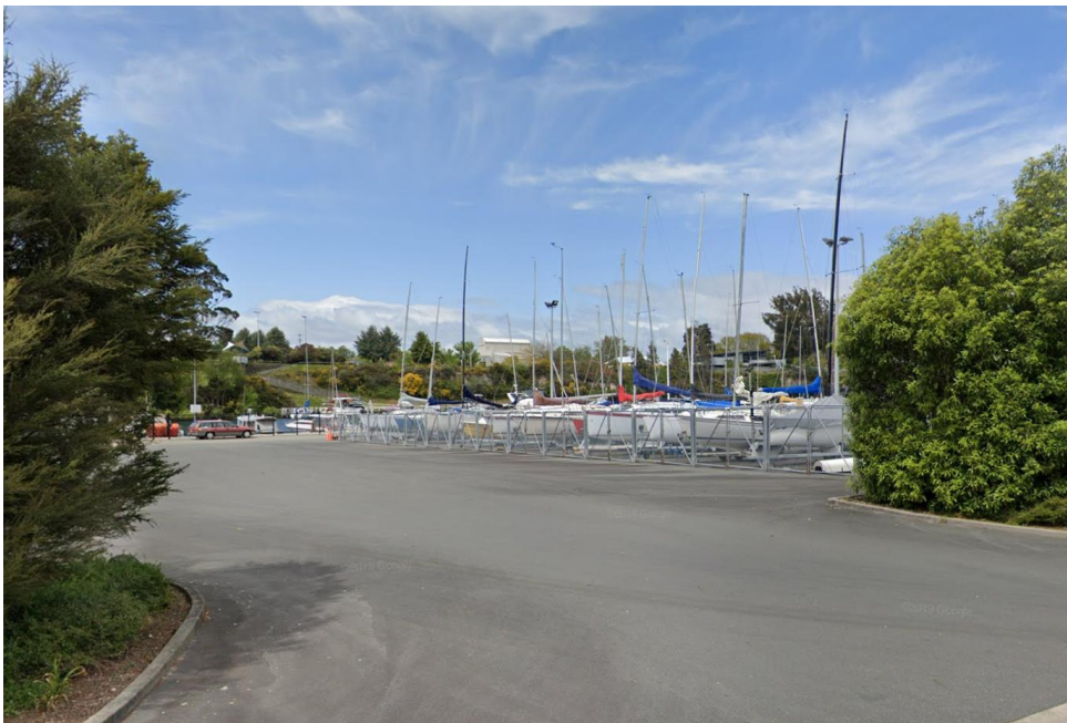
Figure 3 - Street view image of boat pens from Rauhoto Street