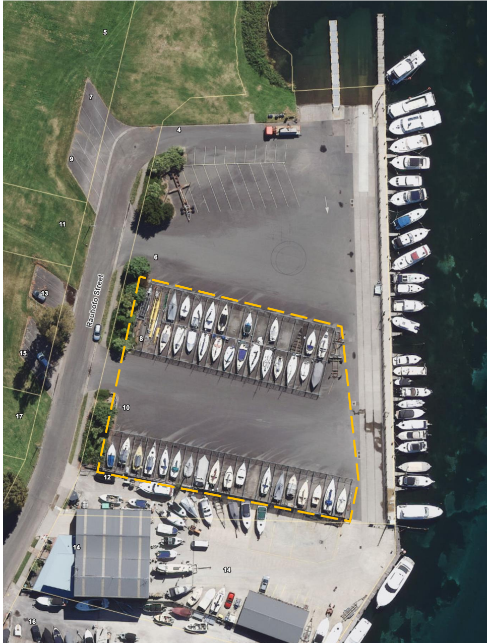
Figure 1 - Boat pen area on Nukuhau Boat Ramp Reserve