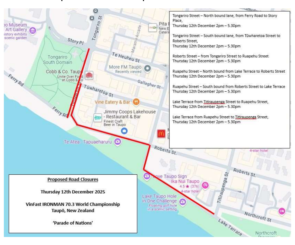
Schedule 1 - Proposed Road Closure Map