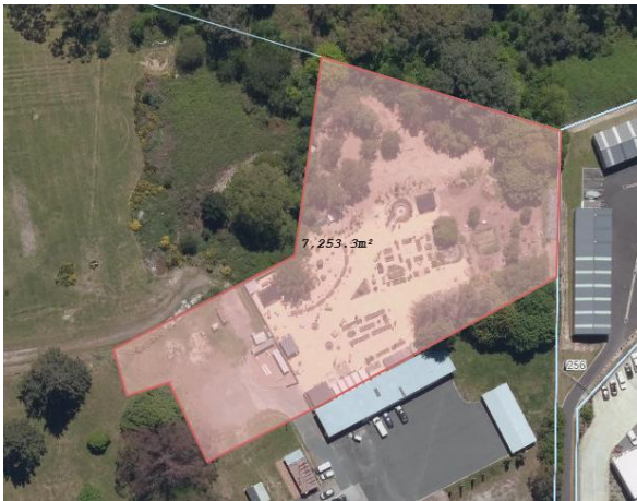
Proposed ground lease area.