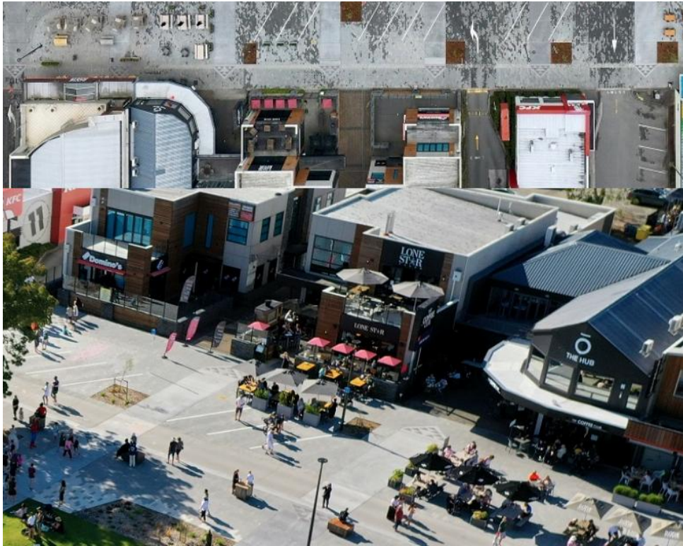
Indicating that it was previously used for parking in front of Lone Star.