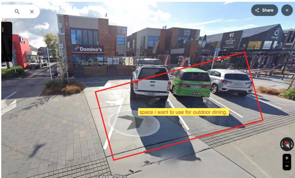
The location the customer wishes to occupy - Copied directly from the customer's email.