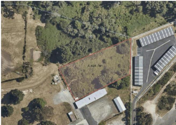
Approved ground lease area in 2023.