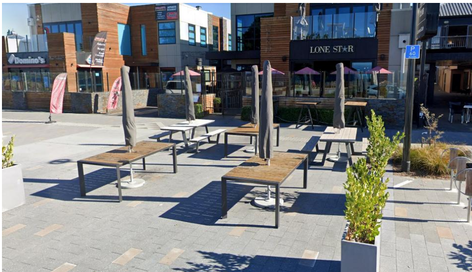
And this is its current appearance.